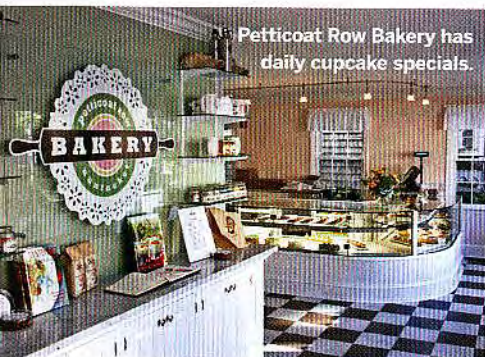
Petticoat Row Bakery has daily cupcake specials.