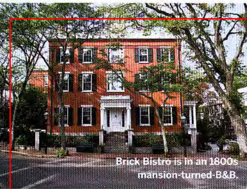
Brick Bistro is in an 1800s mansion-turned-B&B.