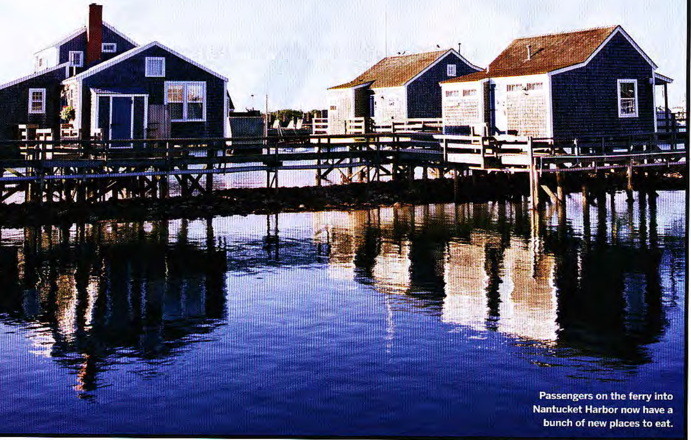
Passengers on the ferry into Nantucket Harbor now have a bunch of new places to eat.