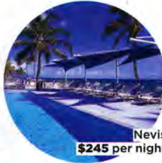
Nevis $245 per night