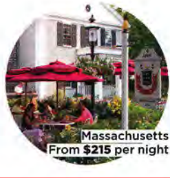
Massachusetts From $215 per night

MASSACHUSETTS Seal the Deal package from the Jared Coffin House (800/248-2405; jaredcoffinhouse.com ), in Nantucket. WHAT'S INCLUDED Two nights in a queen room; one $30 food credit; one 2½-hour seal expedition on a Shearwater Excursions boat. COST From $430 ($215 per night), double, April 1–June 15. SAVINGS 24 percent.