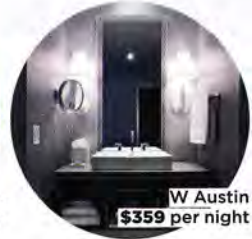
W Austin $359 per night

NORTH CAROLINA Spring Nights on the Outer Banks package at the Sanderling Resort & Spa (800/701-4111; thesanderling.com ), in Duck. WHAT'S INCLUDED Two nights in a North Inn room; daily breakfast; a nighttime crabbing excursion; an outdoor astronomy lesson, with milk and cookies. COST $550 ($275 per night), double, April 1–May 31. SAVINGS 30 percent.