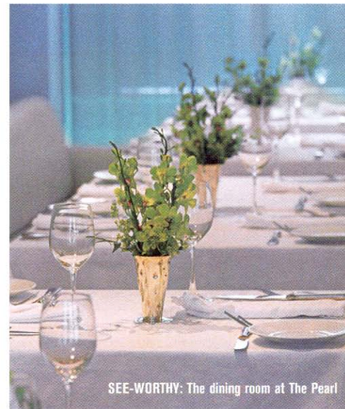
SEE-WORTHY: The dining room at The Pearl