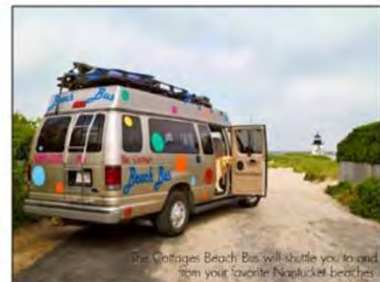
The Cottages Beach Bus will shuttle you to and from your favorite Nantucket beaches!