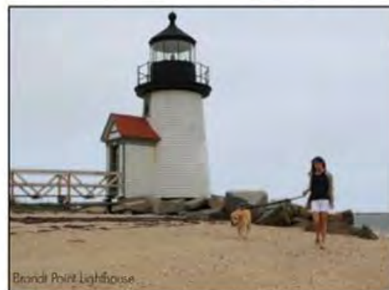
Brandt Point Lighthouse