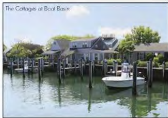
The Cottages at Boat Basin