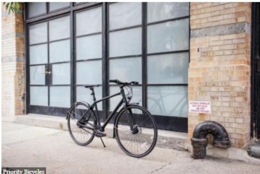
Priority Bicycles A the Tribeca showroom

There are multiple factors that allow us to price as we do. We've set up the business to sell consumer direct, which essentially results in the customer receiving wholesale prices. So by design our pricing is better. We own our warehouse and each bicycle is checked for quality control and shipped by our staff. We handle all service calls internally, 7-days a week. We are a very customer-centric team and all of us are equipped to handle customer inquiries. We are also highly automated. Using my background in software, we've built the company to scale quickly. We have a sophisticated ERP system from Microsoft, and a state-of-the-art customer support system from Kustomer . As a software consultant, I saw a variety of ways that businesses ran inefficiently, resulting in increased costs for their customers. So while we've enjoyed success over our first few years in business, we've always been careful not to expand too quickly. We still operate like a startup, which keeps our overhead and prices low.