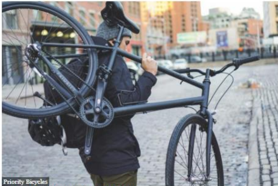
Priority Bicycles A lightweight bike from Priority Bicycles

Opinions expressed by Forbes Contributors are their own.