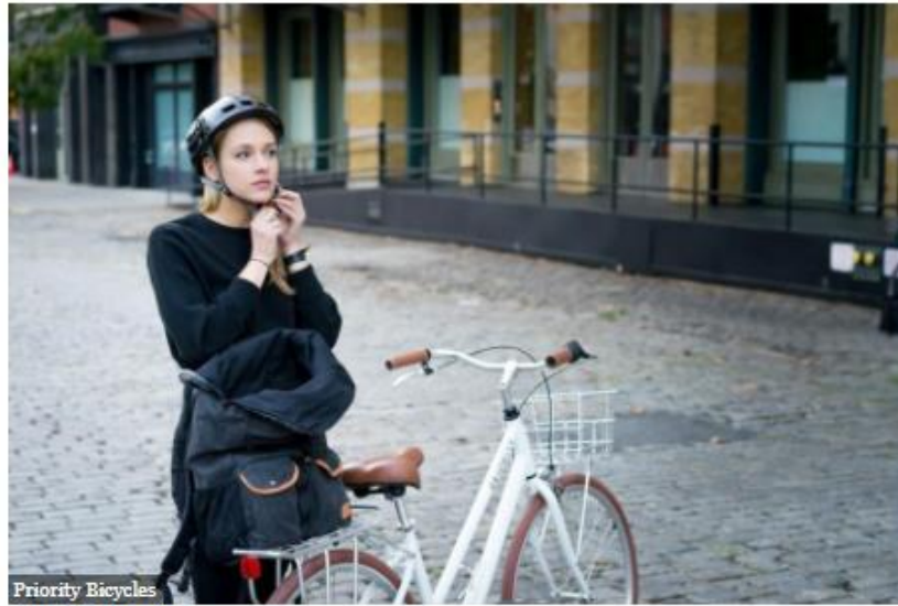
Priority Bicycles Priority Bicycles

Continuum Onyx features front and rear self-powered lights and reflective decals. As our line has grown to include daily commuting, safety has become a huge priority for us.