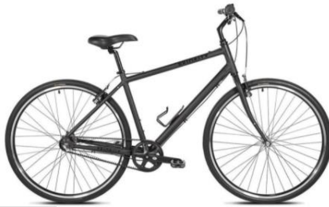
Priority Bicycles Classic Plus Gotham Edition

That said, building a belt drive into a bike is serious work. It requires considerations to be made to the bicycle frame design and gearing systems, plus they cost significantly more. Despite the advantages of the belt drive system, those challenges created barriers to wider adoption within the bike industry. Since we knew it was a great solution, we committed to design and engineering, and finding the right partners, as we did with Gates Carbon Drive , the leading belt drive manufacturer, to deliver a high quality, low maintenance experience at an affordable price.