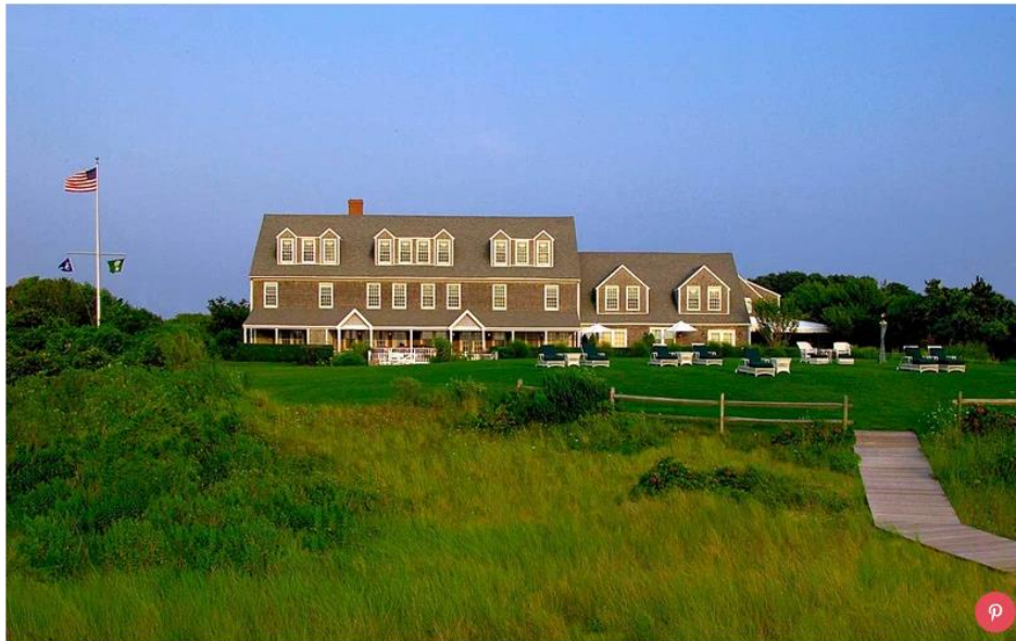
The Wauwinet Inn.

Probably the most adult-feeling thing we did was to take the free island shuttle to the White Elephant's sister property, the Wauwinet ( doubles from $195; more during high season; open April through October ), a charming harborfront inn on a skinny isthmus on Nantucket's eastern end. There, we ate upscale, regionally focused prix-fixe meal on the casual patio of Topper's ( prix-fixe menu $80 ), the hotel's fine-dining restaurant. There were other families there, but the vibe, especially inside in the intimate dining room, felt a bit more see-and-be-seen.