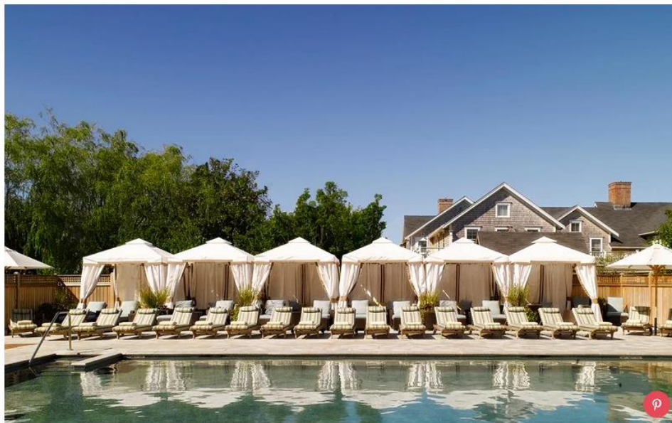
The pool at White Elephant Village.

Besides the lighthouse, the other worthwhile waterfront destination in close proximity to White Elephant Village is Jetties Beach. It doesn't look like much as you approach, but then you get over the dunes and find yourself looking at a perfect New England beach: a wide, protected expanse of fine sand, with still water dotted by white sails beyond. There's a clubhouse at the back of the beach called Sandbar ( open May-September ). We didn't go in, but the sounds emanating from it were straight-up Margaritaville.