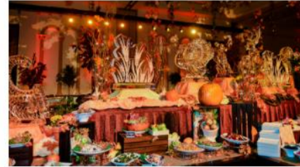
13 Last-Minute Thanksgiving Getaways