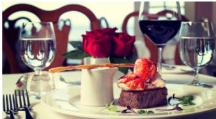
3 Amazing New England Spots To Crack Open A Lobster