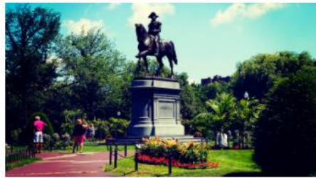
How To Take The Ultimate New England Trip