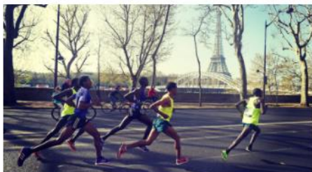
12 Top Marathons Worth Traveling For