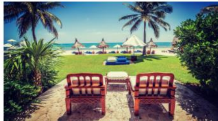
11 New Star-Rated Hotels To Visit Right Now