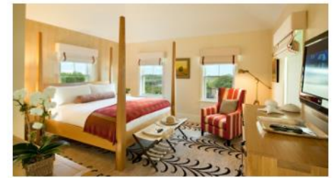
White Elephant Village