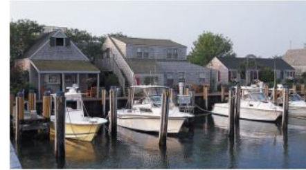
The Cottages & Lofts at the Boat Basin