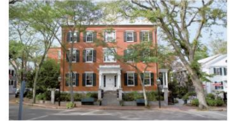
Jared Coffin House