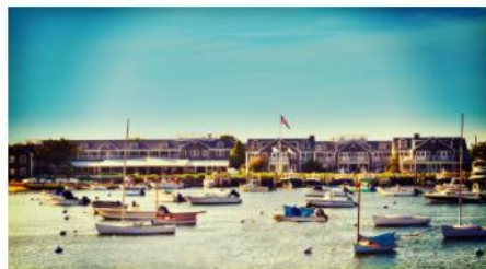
Spending A Perfect Fall Weekend In Nantucket