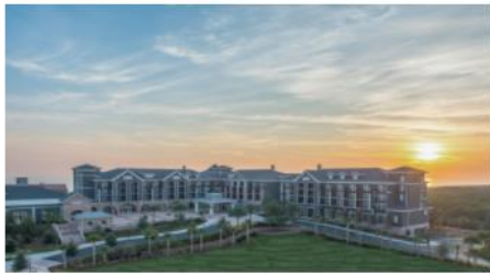
22 Can't-Miss Summer Getaways