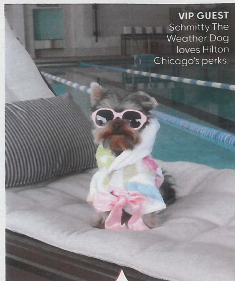
VIP GUEST Schmittty The Weather Dog loves Hilton Chicago's perks.

Enjoy mat Pilates, yoga, Spinning, and tai chi, then indulge at the Crystal Spa and Salon. It features rejuvenating treatments like aroma stone therapy and Japanese silk booster facials. (Cruises from $2,500 per person for six days, crystalcruises.com)