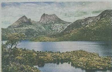
RIDE & SEEK

Tasmanian Tour Ride & Seek, an Australian outfitter offering trips in a dozen countries, has added a destination close to home: an eight-day hiking and biking trip through Tasmania, the rugged island state off Australia's south coast.