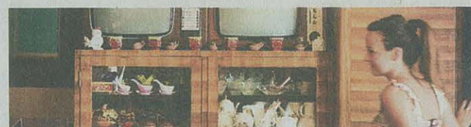
8 NEXT STOP Discovering Tiraná's palpable energy.