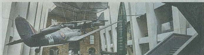
10 HEADS UP In London, Blitz-themed tours and exhibits.