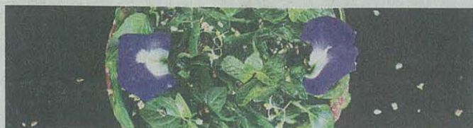
4 CHOICE TABLES Local cuisine takes the stage in Siem Reap.