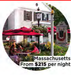
Massachusetts From $215 per night

MASSACHUSETTS Seal the Deal package from the Jared Coffin House (800/248-2405; jaredcoffinhouse.com ), in Nantucket. WHAT'S INCLUDED Two nights in a queen room; one $30 food credit; one 2½-hour seal expedition on a Shearwater Excursions boat. COST From $430 ($215 per night), double, April 1–June 15. SAVINGS 24 percent.