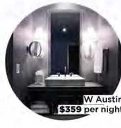
W Austin $359 per night

Capri; unlimited use of hotel amenities, including steam room and indoor pool. COST $1,350 ($675 per night), double, through June 30. SAVINGS 32 percent.