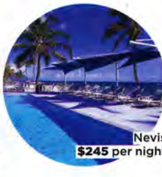
Nevis $245 per night