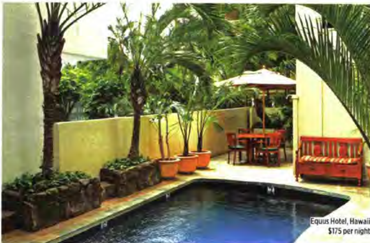
Equus Hotel, Hawaii $175 per night

NEW YORK Farm-to-Table package from the Allegria Hotel (516/889-1300; allegria-hotel.com ), in Long Beach. WHAT'S INCLUDED Two nights in a Deluxe Beach View room; a five-course tasting menu at the Atlantica restaurant. COST From $660 ($330 per night), double, September 7–October 31. SAVINGS 41 percent.