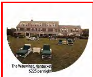
The Wauwinet, Nantucket $225 per night