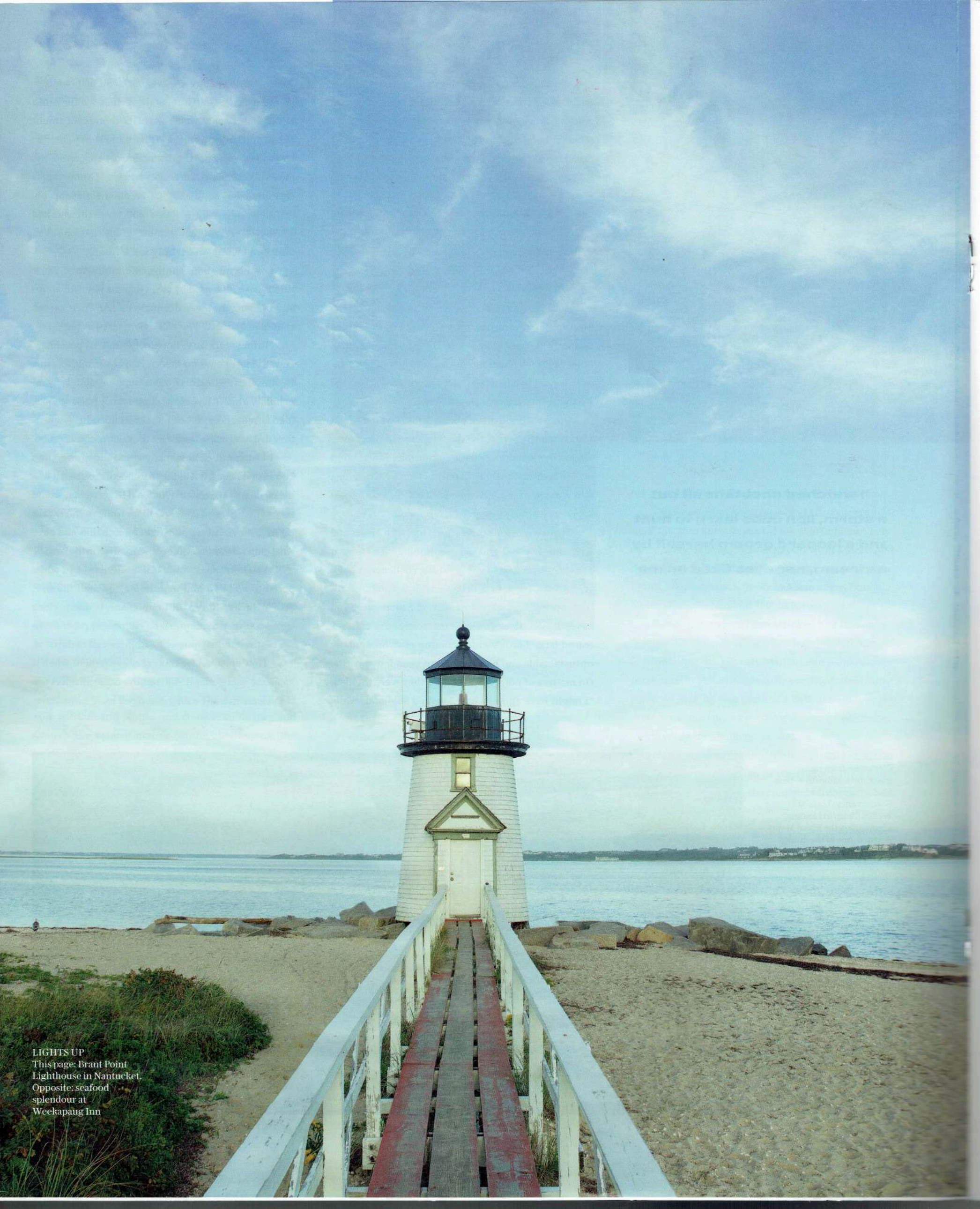
LIGHTS UP This page: Brant Point Lighthouse in Nantucket. Opposite: seafood splendour at Weekapaug Inn