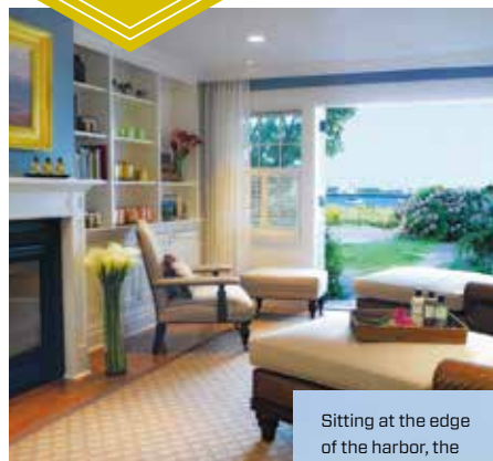
Sitting at the edge of the harbor, the spa is steeped in island charm

Location: 48°30'16.9"N 122°50'15.0"W Price: $8.75m Agent: Windermere Real Estate, windermere.com USP: A ready-made family home in the sought-after San Juan Islands Celebrity neighbor: Bill Gates owns a secluded home on nearby Shaw Island Robinson Crusoe factor: 3/10