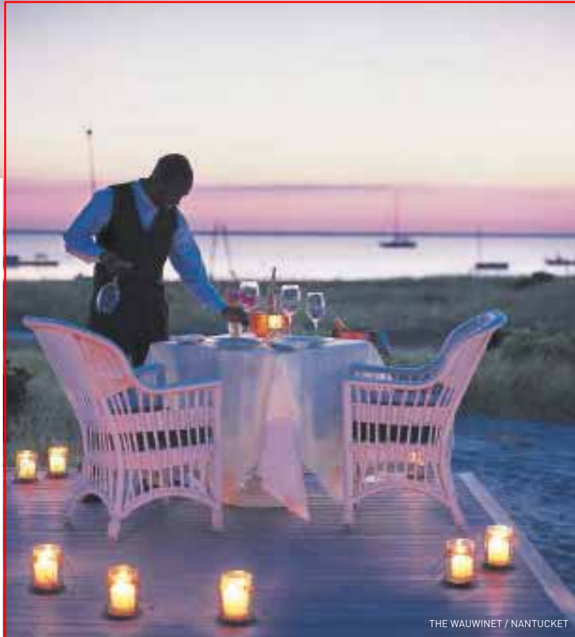
THE WAUWINET / NANTUCKET