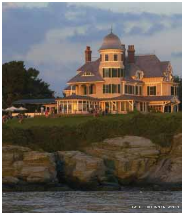
CASTLE HILL INN / NEWPORT