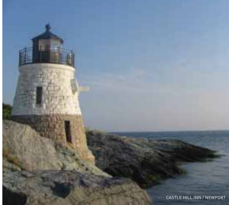
CASTLE HILL INN / NEWPORT